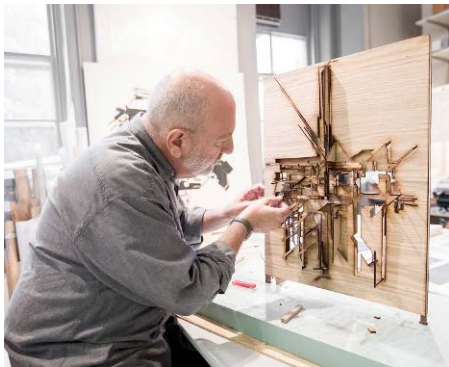
Developing the bas-relief

The second piece, Janus (2015) is a freestanding, two-sided piece of laser-cut thin oak veneer that illustrates The Architect's shadow-map.