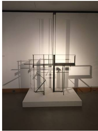
The Architect Welded Steel Sculpture

The second piece, Janus (2015) is a freestanding, two-sided piece of laser-cut thin oak veneer that illustrates The Architect's shadow-map.