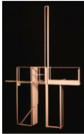
The Architect Shadow Caster