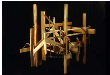
Collaborative Construct 1993